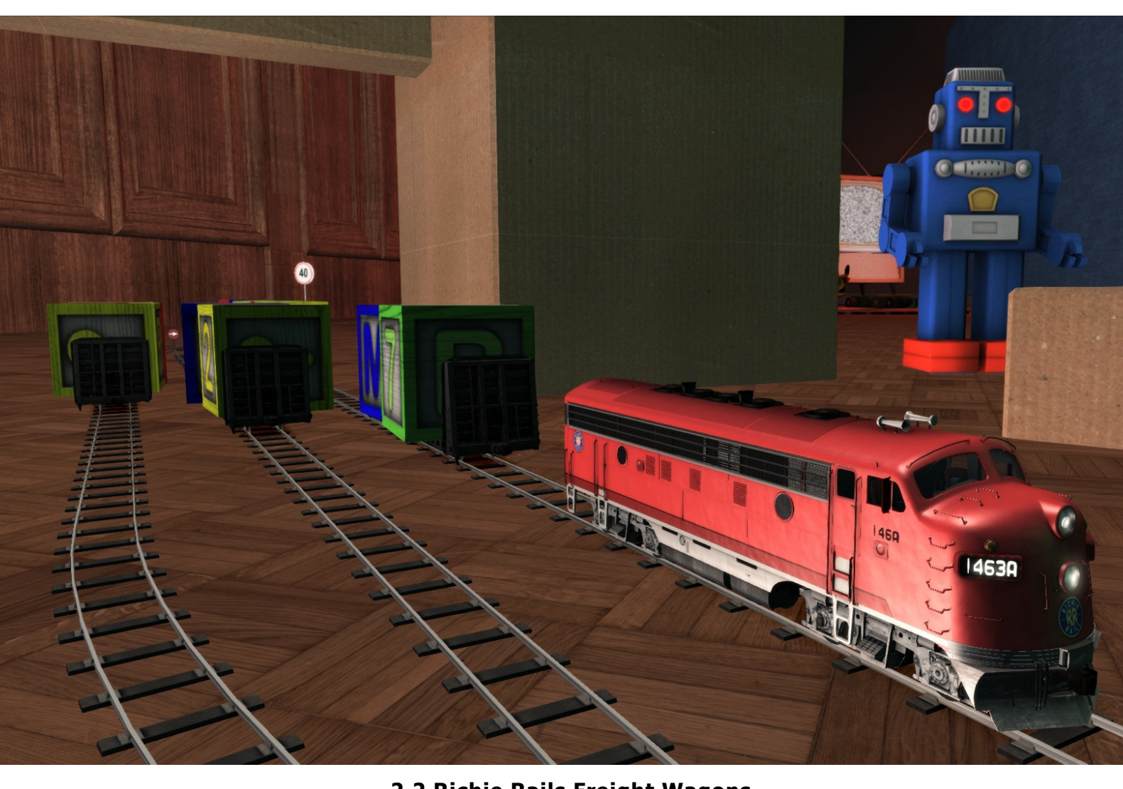
2.2 Richie Rails Freight Wagons