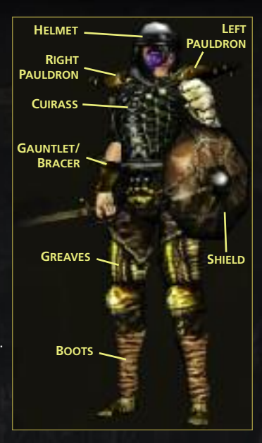
Percent of Total Armor Armor Piece Rating

Your armor rating is the weighted average of all the armor you are wearing. Certain pieces contribute more towards your rating than others.