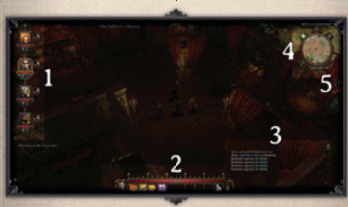
1. Character list 2. Status Bar 3. Game log 4. Minimap 5. Rift Travel

Below each portrait are two buttons: Skills and Inventory . Single-clicking these brings up that character's Skills panel or Inventory panel respectively. Multiple Inventory panels can be opened simultaneously in order to compare characters and facilitate trade between them.