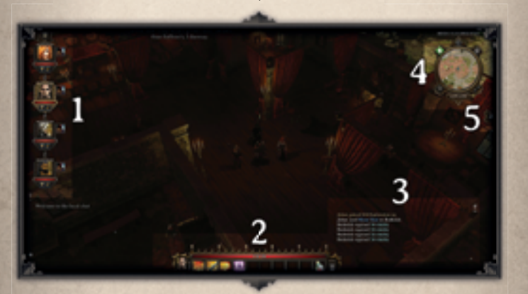
1. Character list 2. Status Bar 3. Game log 4. Minimap 5. Rift Travel

Below each portrait are two buttons: Skills and Inventory . Singleclicking these brings up that character's Skills panel or Inventory panel respectively. Multiple Inventory panels can be opened simultaneously in order to compare characters and facilitate trade between them.