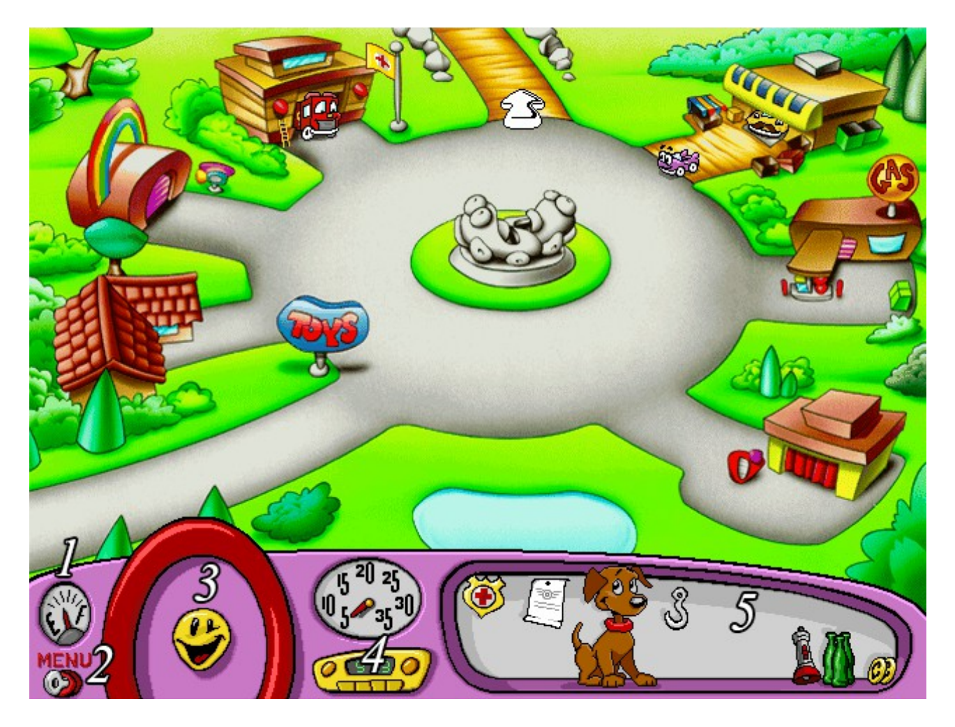
1 This is Putt-Putt's Fuel Meter.