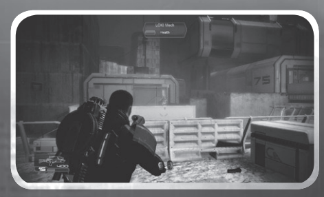
SWITCH TO PREVIOUS WEAPON