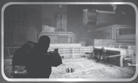
BRING UP NAVIGATION ASSISTANCE