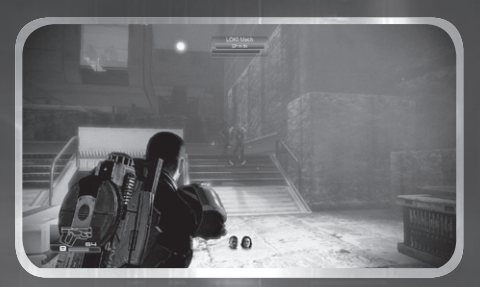
Target an enemy

When a power is marked red with a downward arrow, it means it is already in use or should not be used.