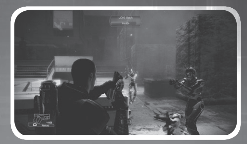
RELOAD THERMAL CLIP