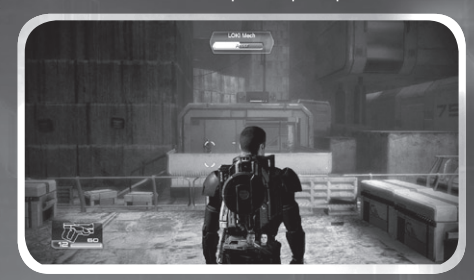
ENTER COMBAT STANCE EXIT COMBAT STANCE

Pay special attention to "overloaded" buttons that require a tap or a press and hold to enable.