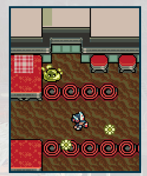
You cannot walk over the red burners on the ground, but you can still suck up and shoot enemies over them!