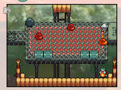
This unique gate will only open if all the slimes are set on fire!